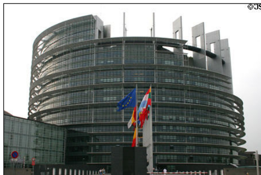
EU Parliament Building in Strasbourg