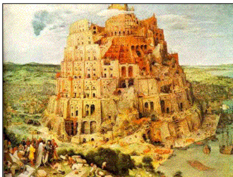
"Tower of Babel" by Pieter Brueghel (1563)