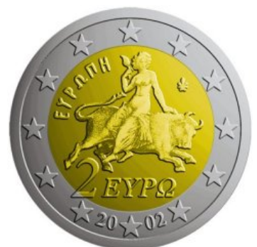
2 Euro Coin